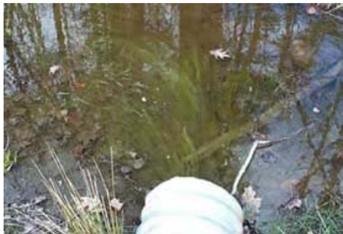
Strands of algae from a drainage pipe