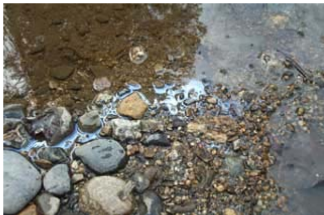
Natural oily sheen