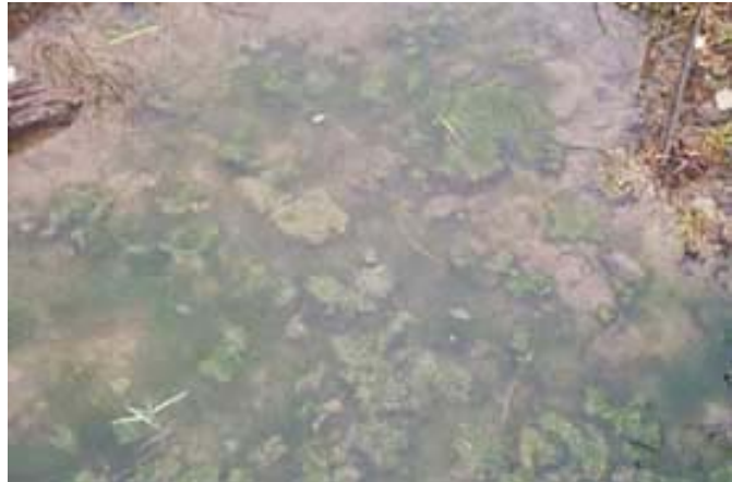
Clumps of algae in a stream

Call the Department of Planning at 914-995-4400 if you have a concern with algae.