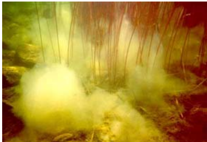
Metaphyton clouds in a lake.